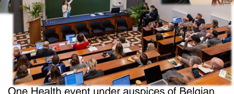
One Health event under auspices of Belgian EU Presidency – April 2024