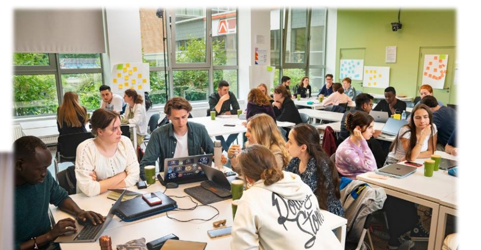
One Health Summer School - 2023