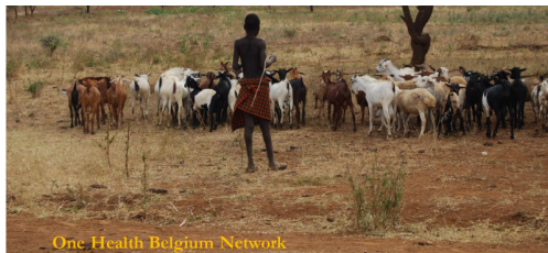
One Health Belgium Network Launching event, 5th November 2019

DIERENARTSEN VETERINAIRES ZONDER GRENZEN BELGIUM