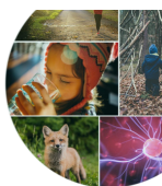
Sarah Gabriel (UGent): One Health in research • More healthy and productive lives through multidisciplinary research • Capacity building and translation of findings into policy • Food/waterborne zoonotic parasitic diseases • Antimicrobial resistance • Malaria prevention