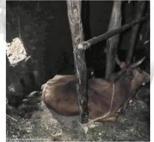
Malaria prevention via zoonoehylaxis