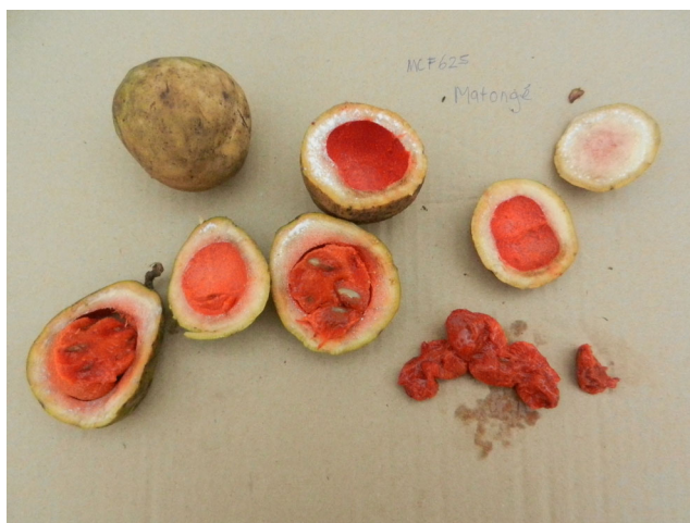
Fig. 2. Fresh Matonge fruits ( Landolphia owariensis ), a popular, wild-harvested fruit in the DRC.

We observed that the somewhat similar-looking and tasting fruits of the West African savanna liana Saba senegalensis (A. DC.) Pichon were also marketed as ‘Matonge’ in two shops, although this species does not occur in Congo and was probably