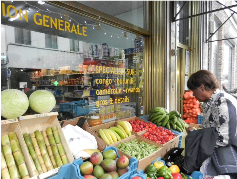
Fig. 1. African food shops along the main commercial street at Matonge.

Matonge. We asked them to name the (vernacular) names of the species they bought, their motivation to buy medicinal plants, how they purchased the herbal medicine (from shops or via the informal circuit), and for which ailments they used these plants. Prior informed consent was obtained from all plant vendors and consumers before the interviews and the collection of data on plant names and uses.