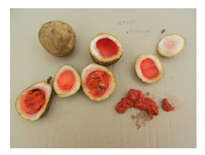
Fig. 2. Fresh Matonge fruits ( Landolphia owariensis ), a popular, wild-harvested fruit in the DRC.

We observed that the somewhat similar-looking and tasting fruits of the West African savanna liana Saba senegalensis (A. DC.). Pichon were also marketed as 'Matonge' in two shops, although this species does not occur in Congo and was probably