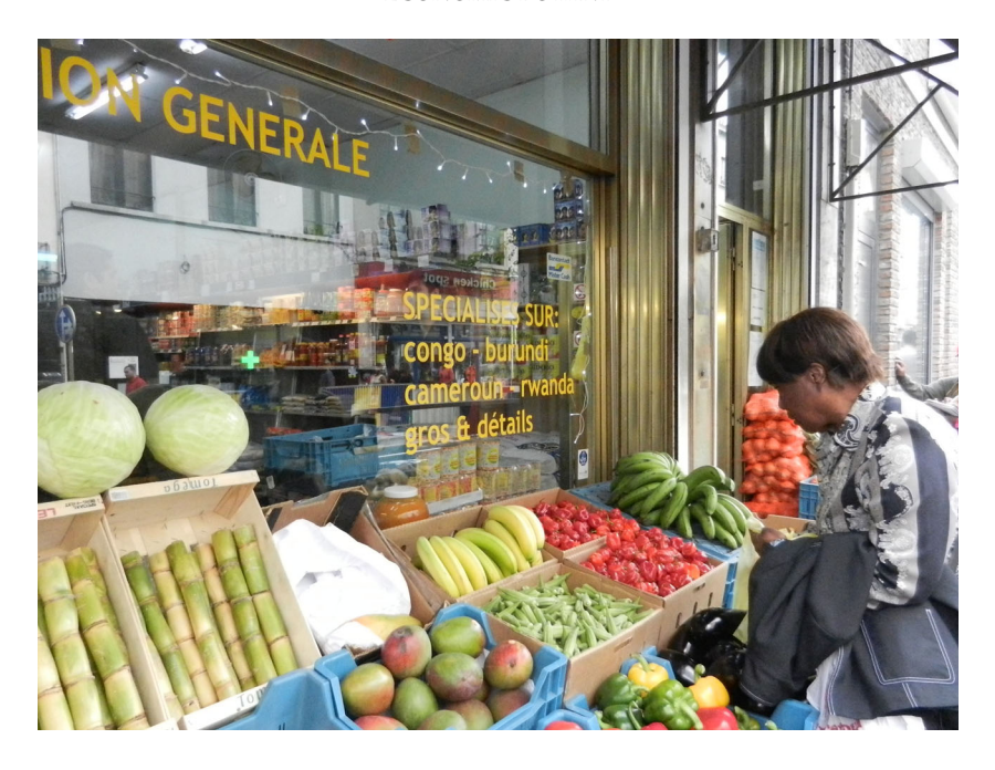
Fig. 1. African food shops along the main commercial street at Matonge.

Matonge. We asked them to name the (vernacular) names of the species they bought, their motivation to buy medicinal plants, how they purchased the herbal medicine (from shops or via the informal circuit), and for which ailments they used these plants. Prior informed consent was obtained from all plant vendors and consumers before the interviews and the collection of data on plant names and uses.